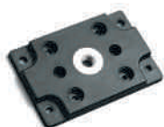
Tripod Adaptor VCT-ST701