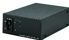
Camera Adaptors DC-700