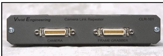
CLR-101 Front Panel