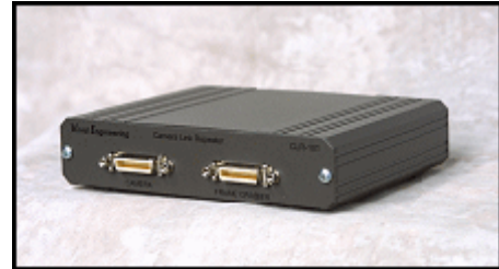
Vivid Engineering CLR-101

The CLR-101 Camera Link Repeater is a cost-effective approach to increasing separation between camera and frame grabber. One Camera Link cable connects the camera to the CLR-101, and a second cable connects the CLR-101 to the frame grabber. This solution provides a 20 meter reach between camera and frame grabber using a pair of standard 10m Camera Link cables. Several CLR-101s and cables may be added to support greater distances. The CLR-101 supports the Camera Link “base” configuration. “Medium” configuration applications are supported using two CLR-101s. The CLR-101 Camera Link Repeater is housed in a sturdy, compact aluminum enclosure and is well suited for industrial environments.