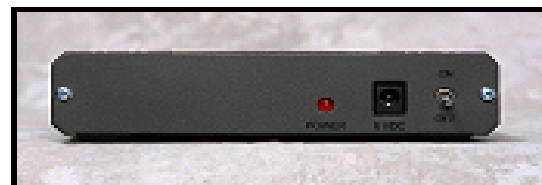
CLR-101 Rear Panel